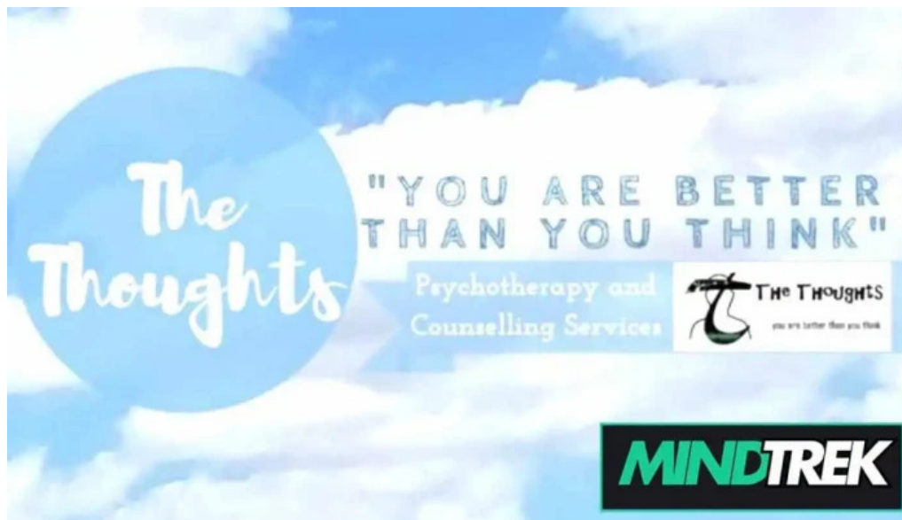
The thoughts hamilton