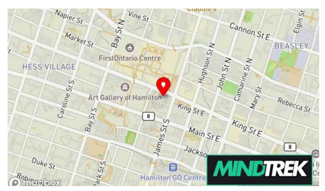
Vital minds psychotherapy map