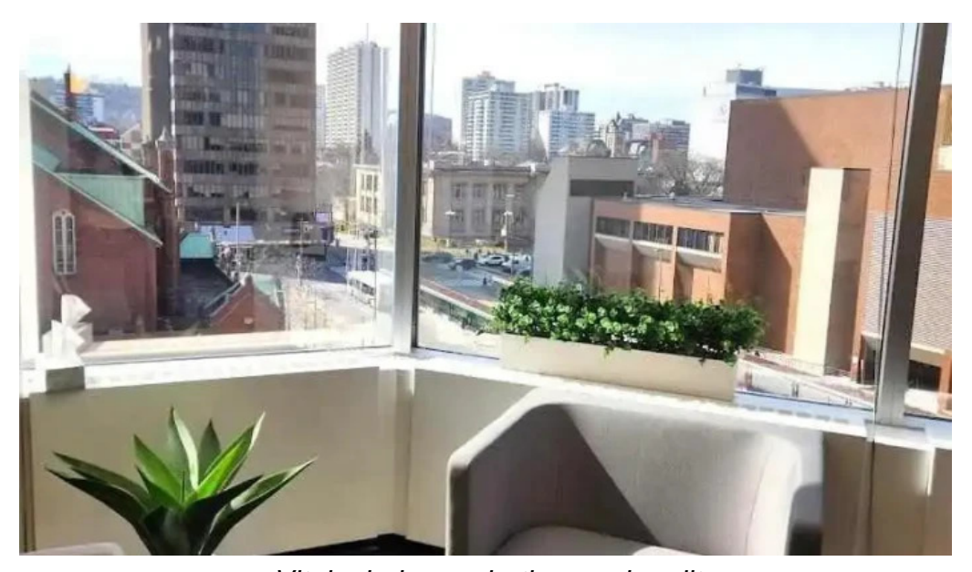
Vital minds psychotherapy hamilton