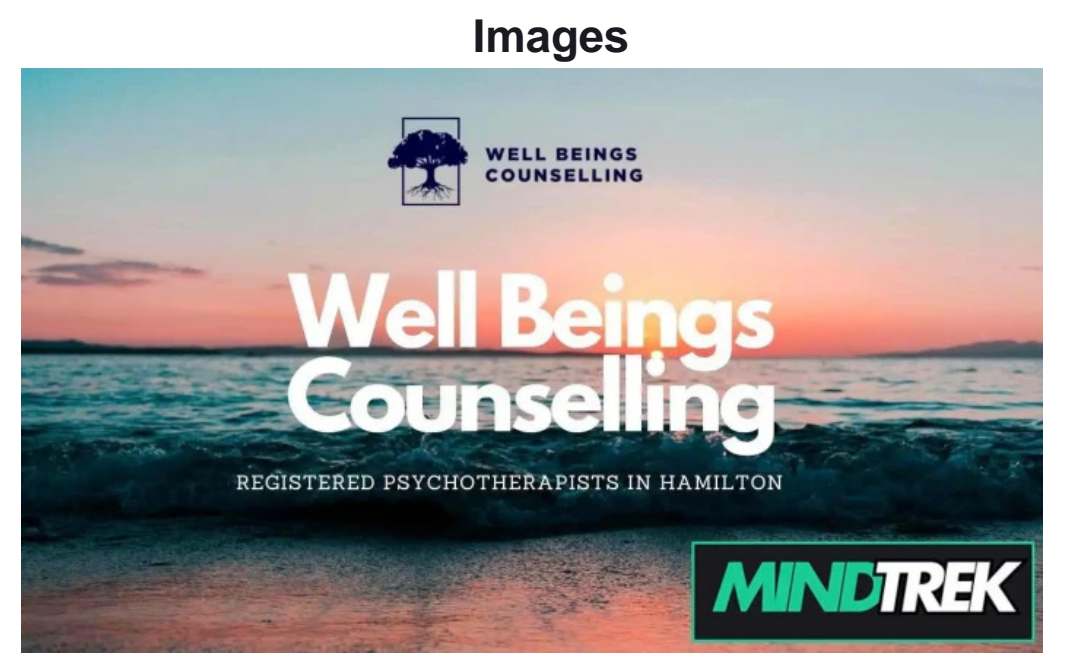
Well beings counselling hamilton hamilton

In case you want to adjust any element that you believe is not correct about this page, we kindly request send a message and we will adjust it at the earliest convenience. In advance we appreciate it.