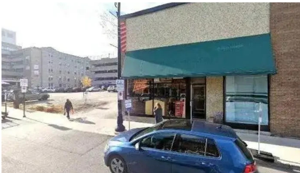
Kim marshall counselling psychotherapy all