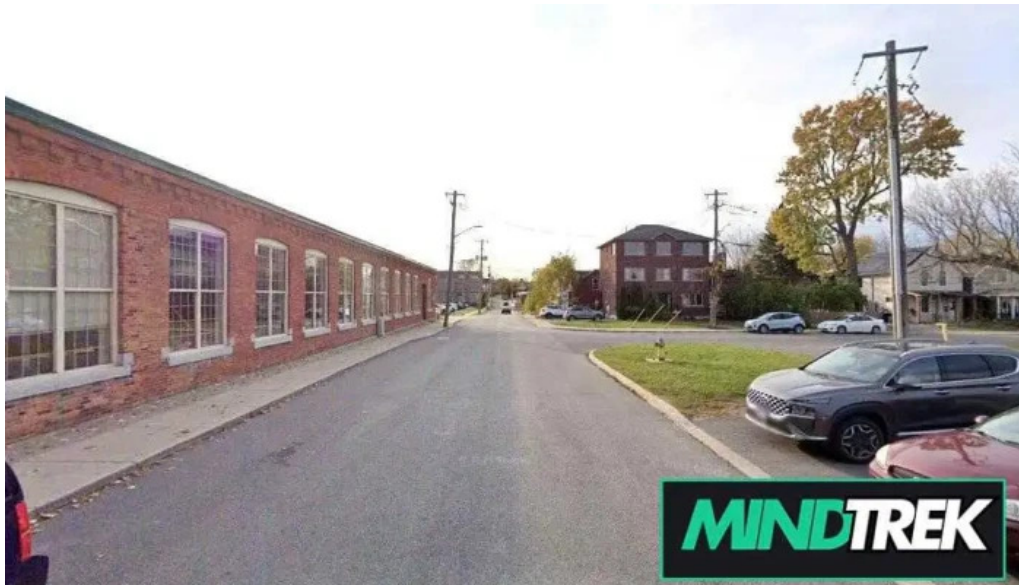
Rhonda newell counselling kingston