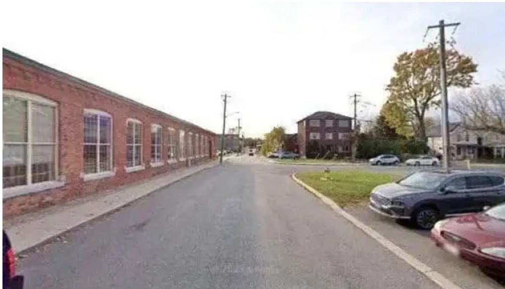
Rhonda newell counselling all