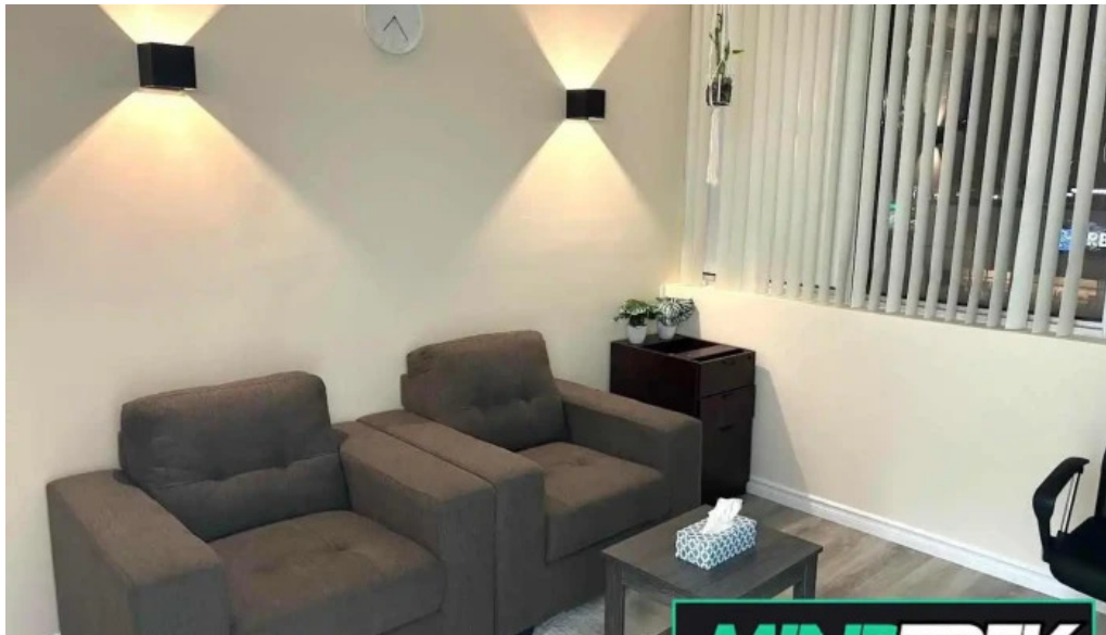
Bloom clinical care mississauga mississauga