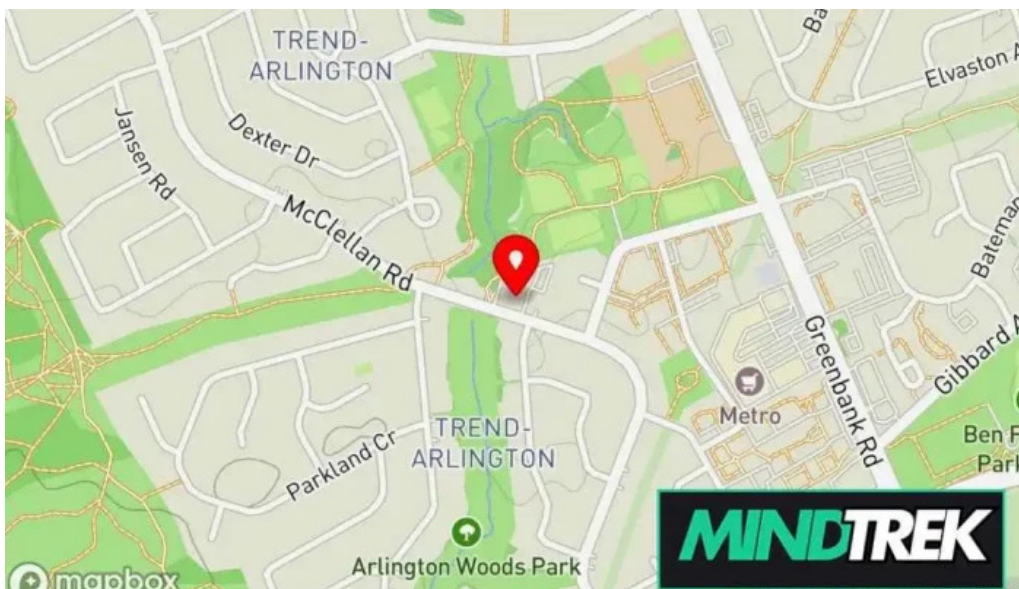
Asperger counselling therapy services map