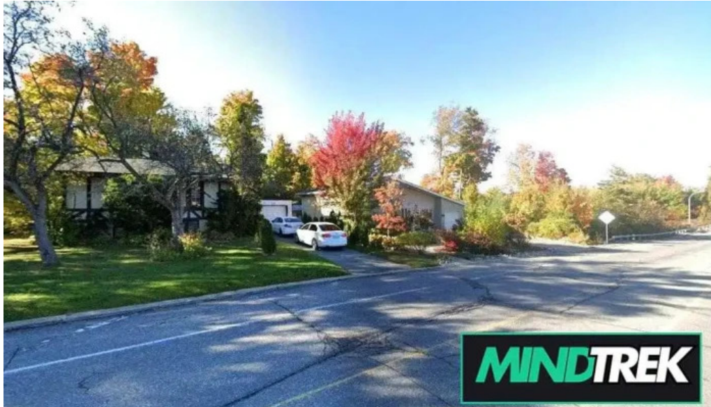
Asperger counselling therapy services nepean