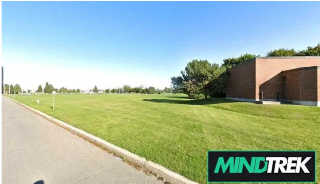
Gary tse counselling psychotherapy services nepean