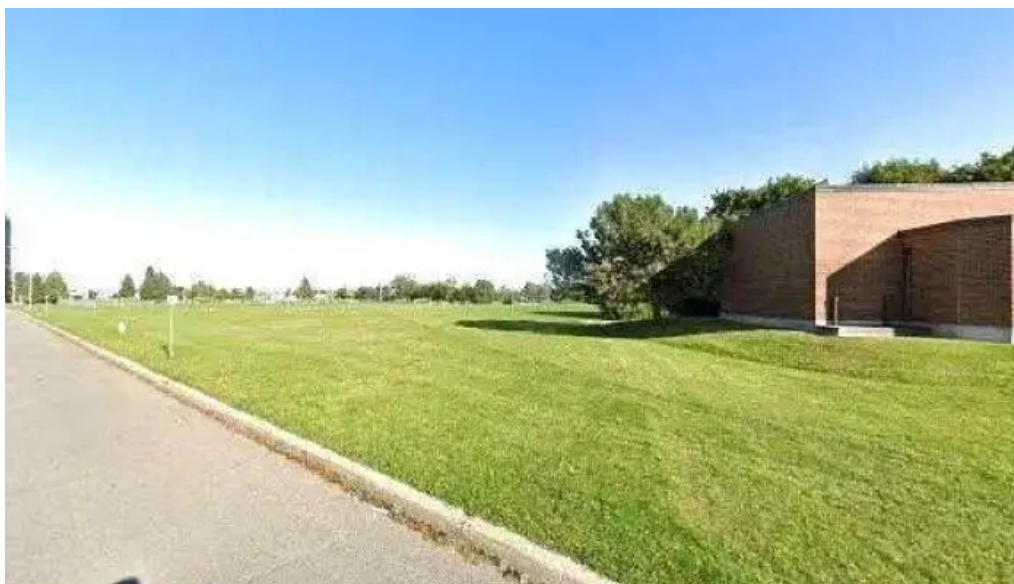
Gary tse counselling psychotherapy services all