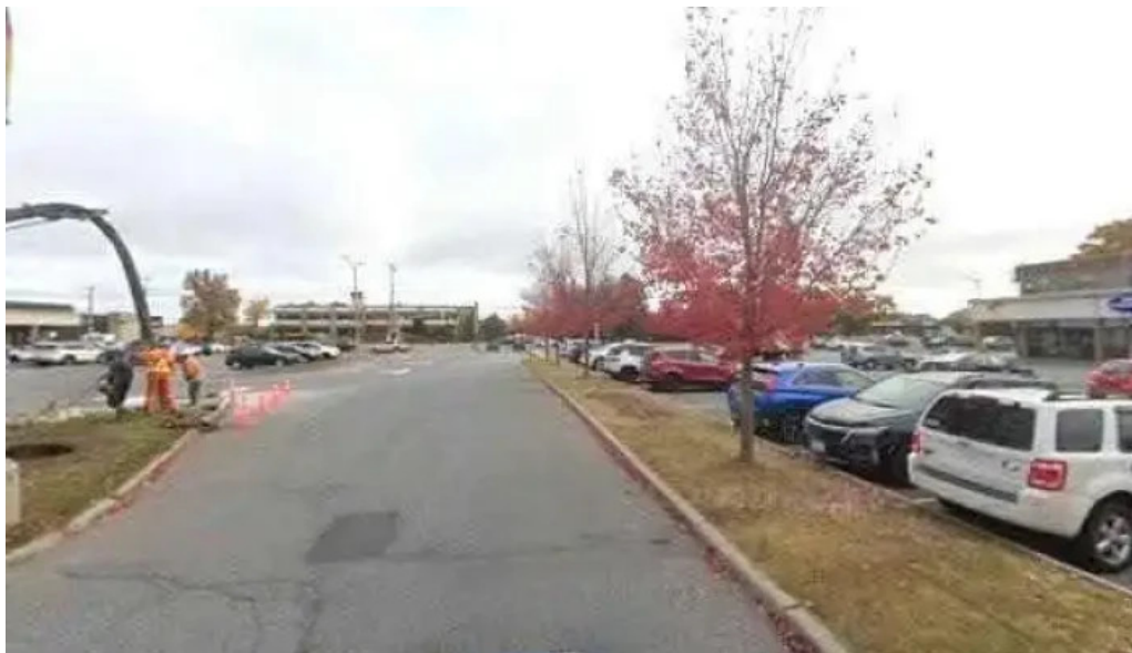
Greenbank counselling and psychotherapy all