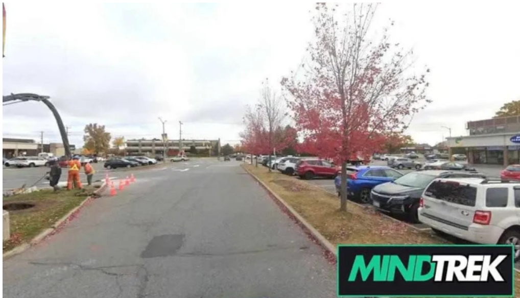
Greenbank counselling and psychotherapy nepean