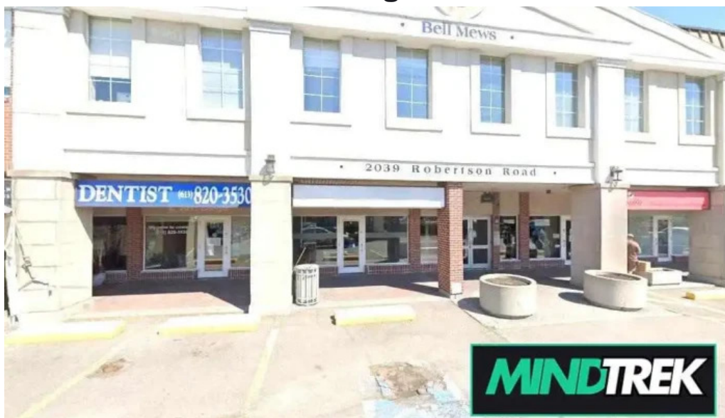
Rita onwodi psychotherapy nepean