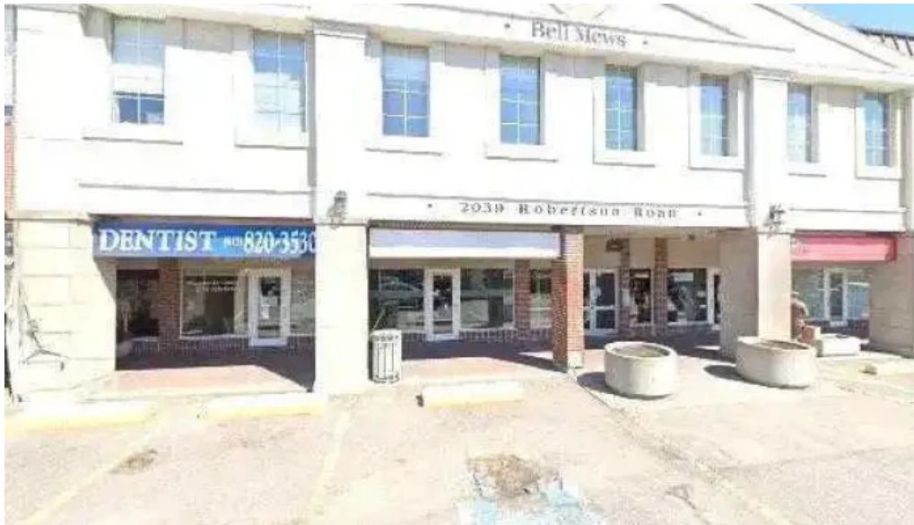
Rita onwodi psychotherapy all