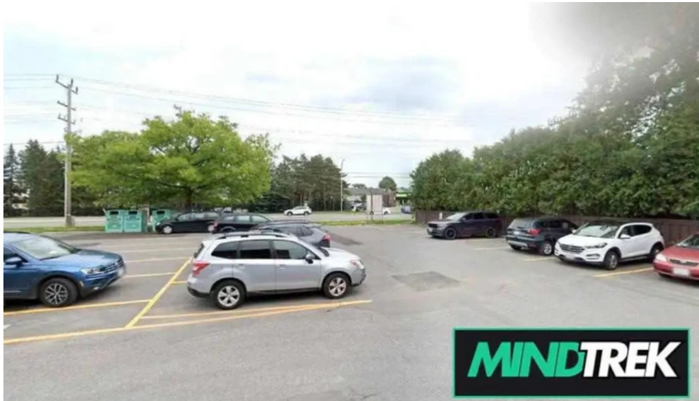
South west counselling centre nepean