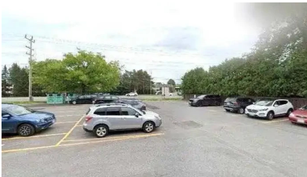
South west counselling centre all