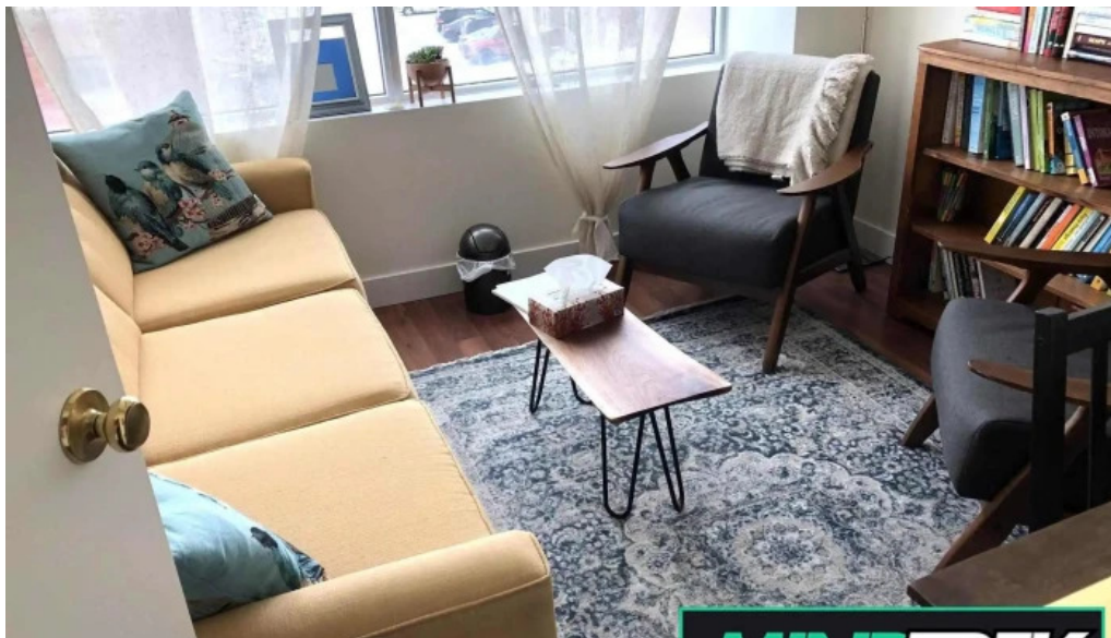
Feel good therapy all