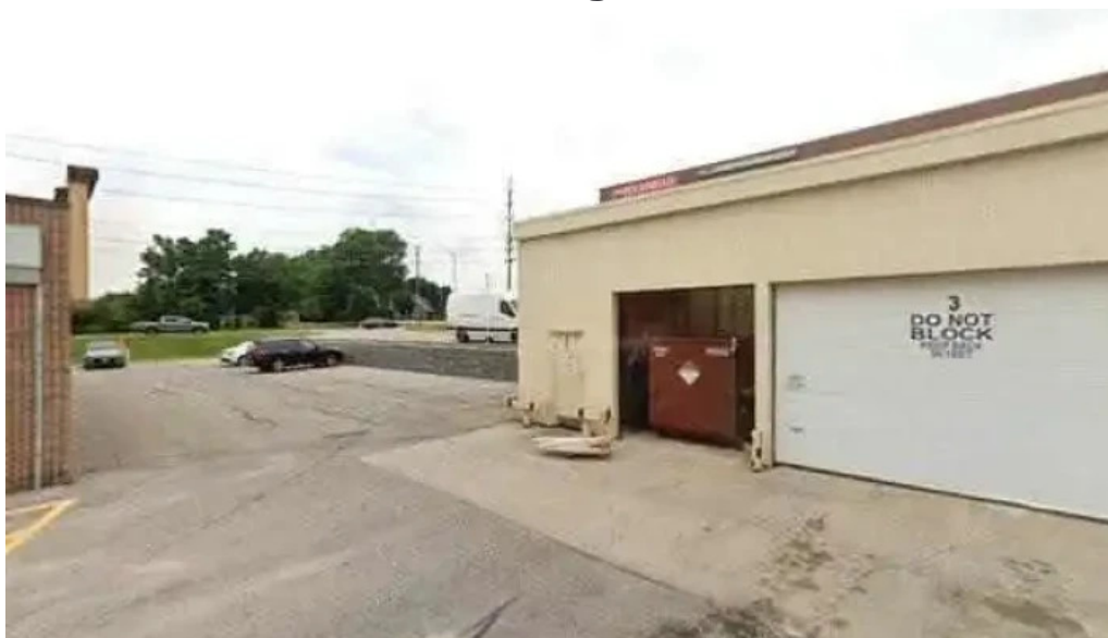
Feel good therapy street view 360deg