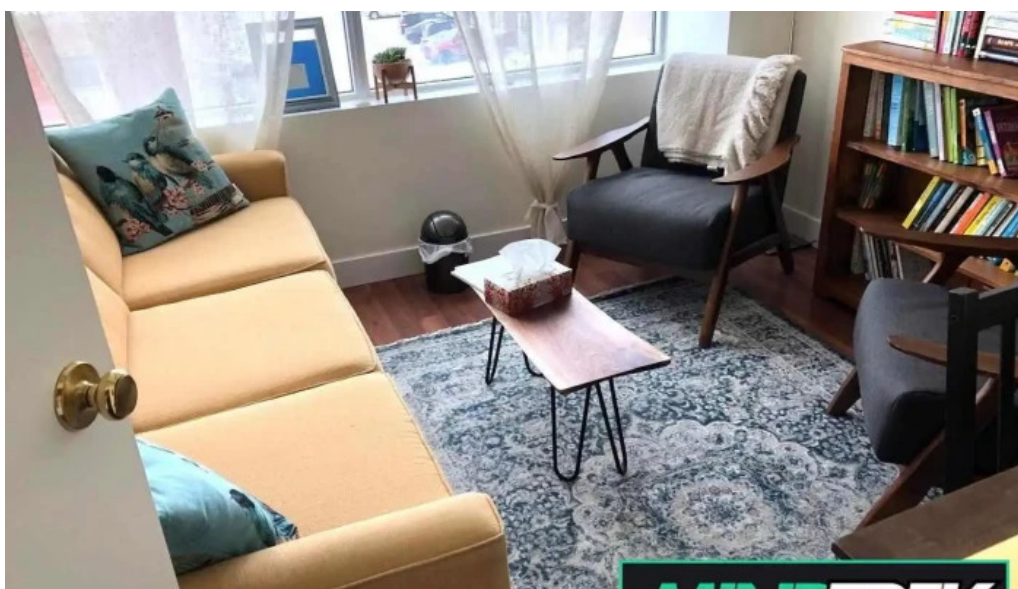
Feel good* therapy newmarket