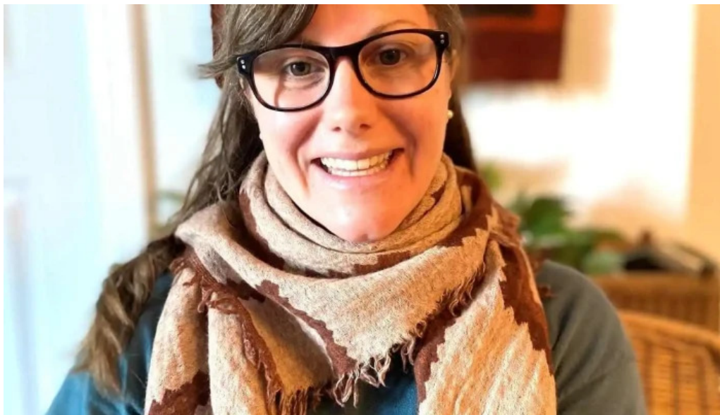
Feel good therapy by owner