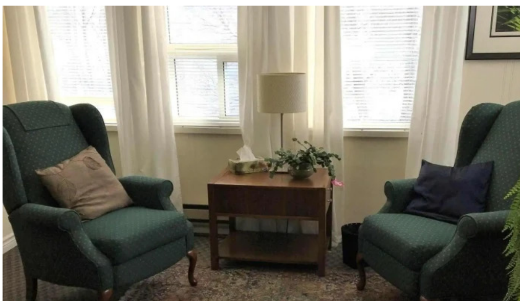
Janice hall holistic psychotherapy all