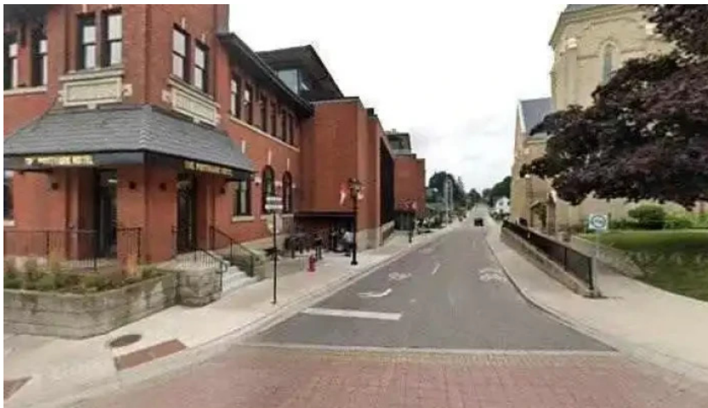
Janice hall holistic psychotherapy street view 360deg