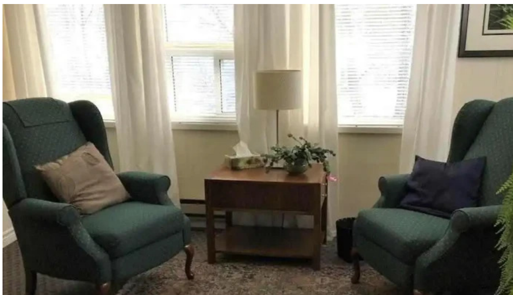
Janice hall holistic psychotherapy newmarket