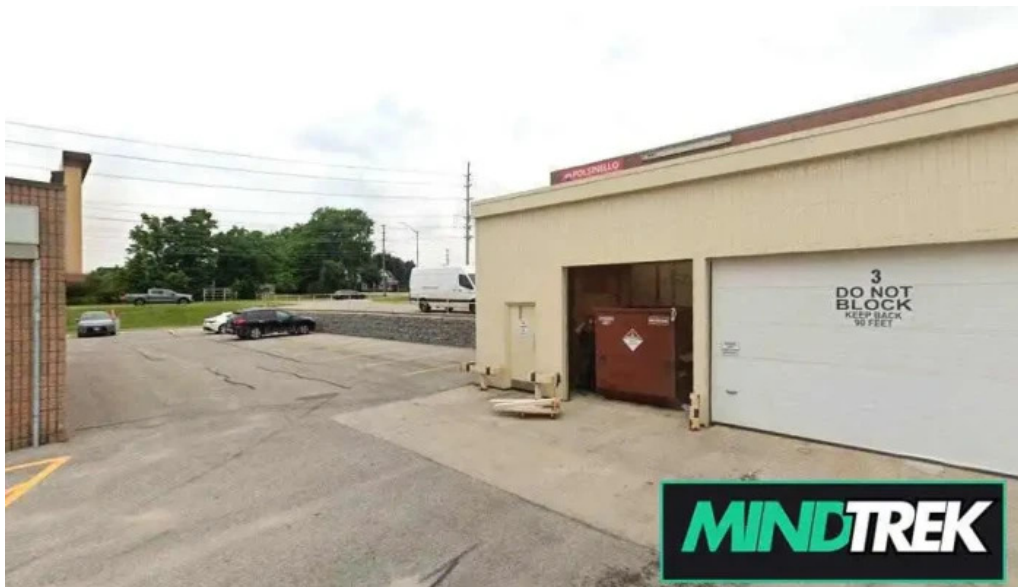
Mcm counselling services newmarket