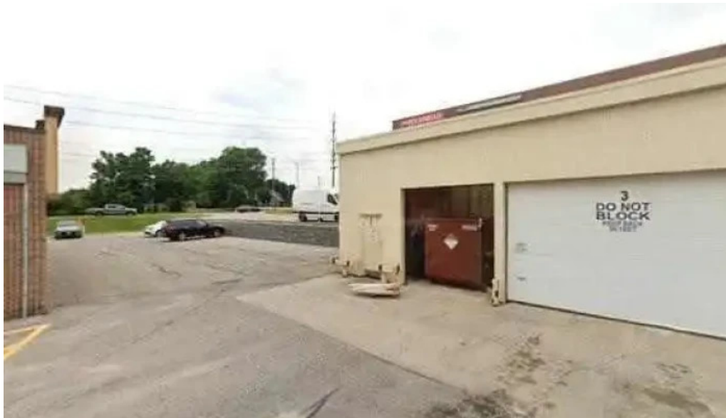
Mcm counselling services all