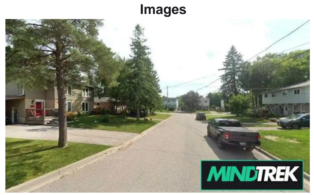
Medical psychotherapy association canada newmarket

In case you want to update any data that you consider is not correct related to this page, please deliver a message and we will handle it at the earliest convenience. In advance we appreciate it.