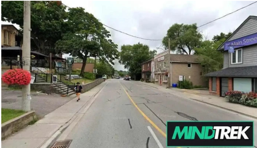
Pillars of hope counselling psychotherapy newmarket