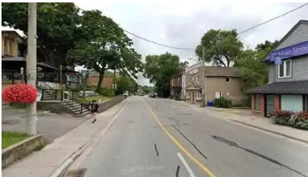
Pillars of hope counselling psychotherapy all