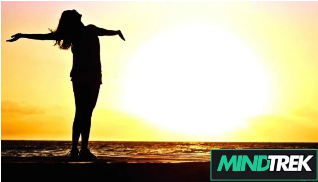
Simple advice counseling centre newmarket