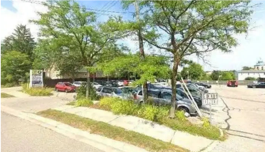
Simple advice counseling centre street view 360deg