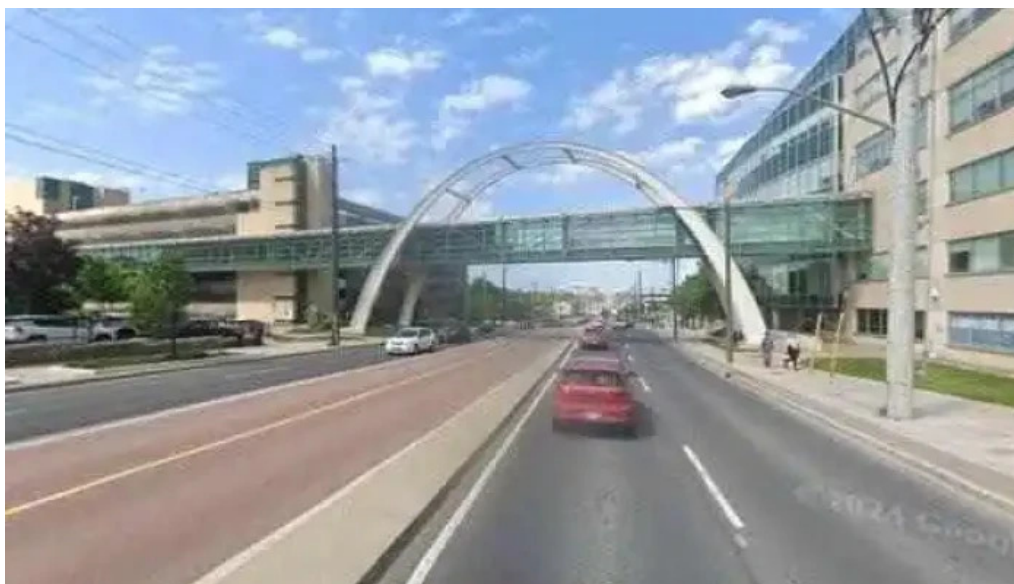
York region stress and anxiety clinic all