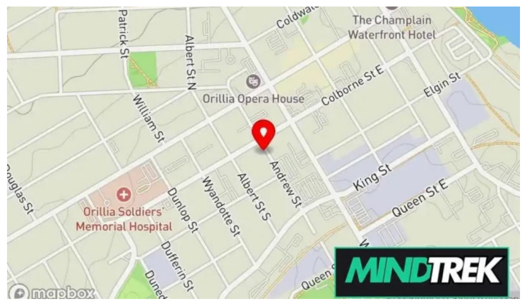
Candy potter registered psychotherapist map