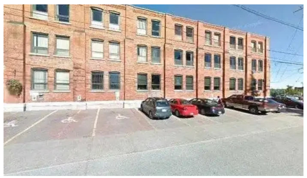
Candy potter registered psychotherapist all