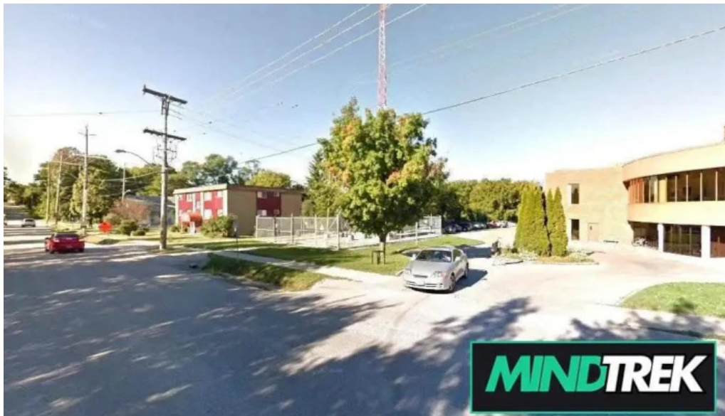
Miller health chiro and physio orillia