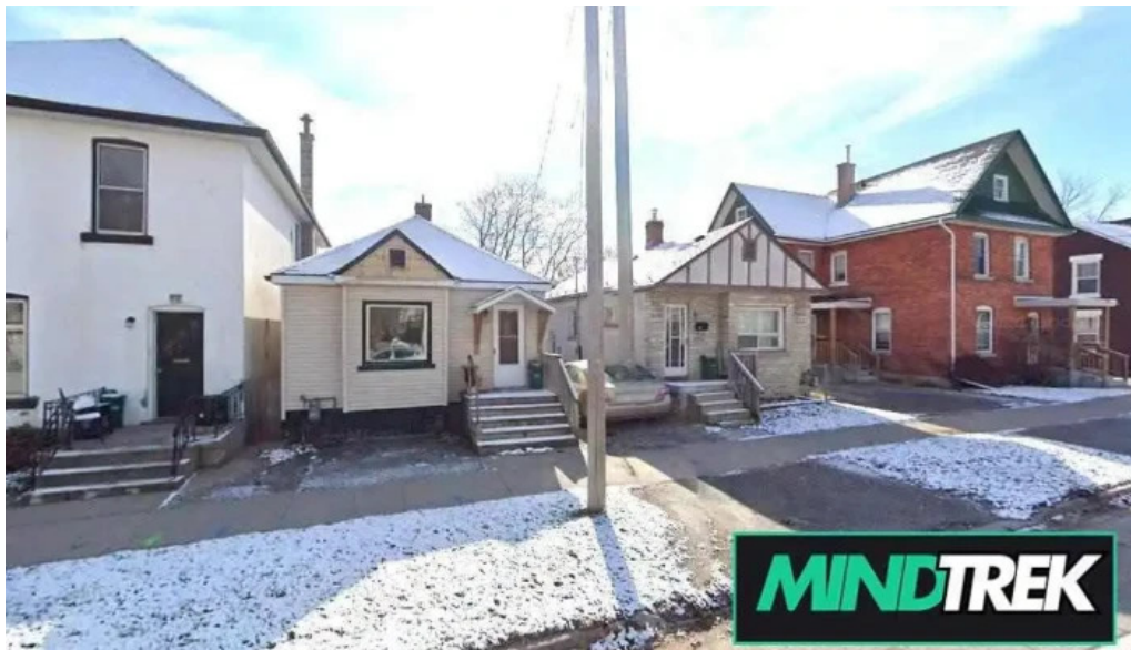
Sparrow therapy orillia