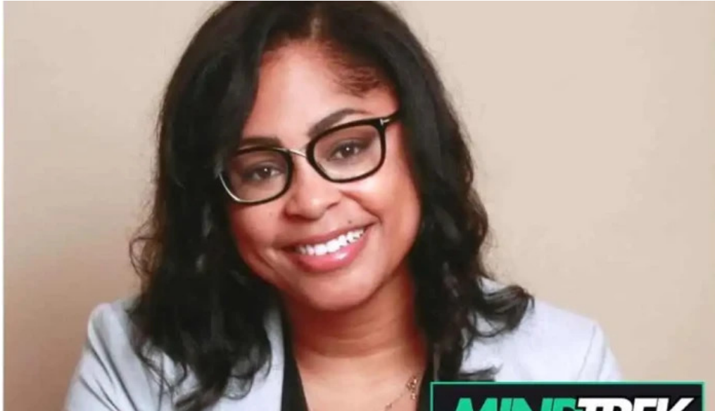
Tk therapeutic services by owner