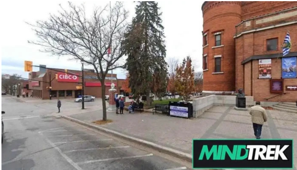
Tk therapeutic services orillia