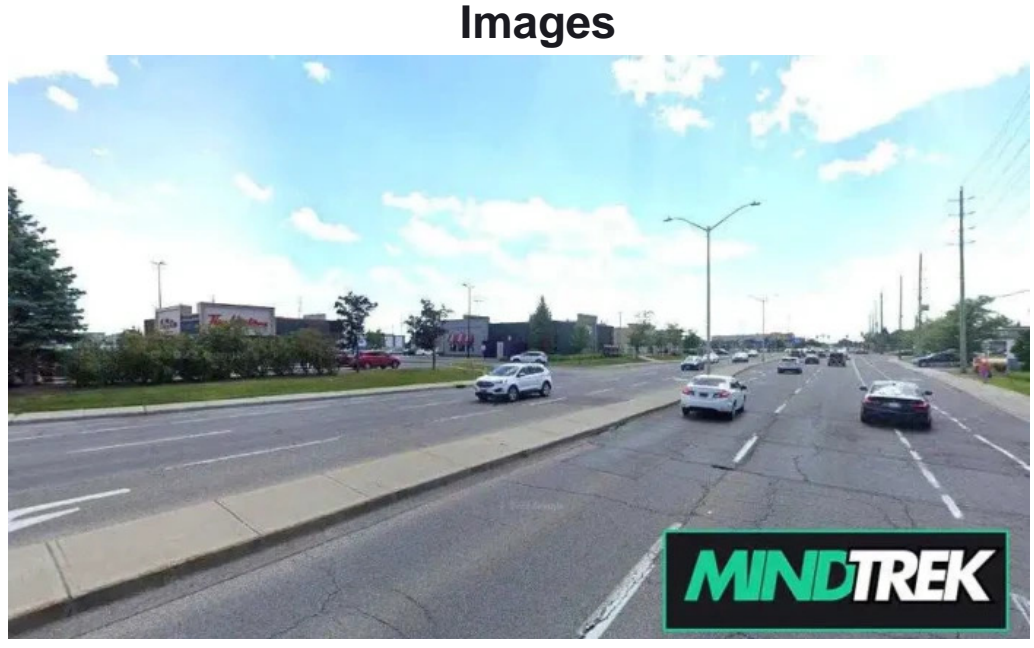
Breckenridge counselling orleans

If you need to modify any detail that you feel is incorrect regarding this portal, we urge you to deliver a message so that we will adjust it quickly. Thank you in advance we appreciate it.