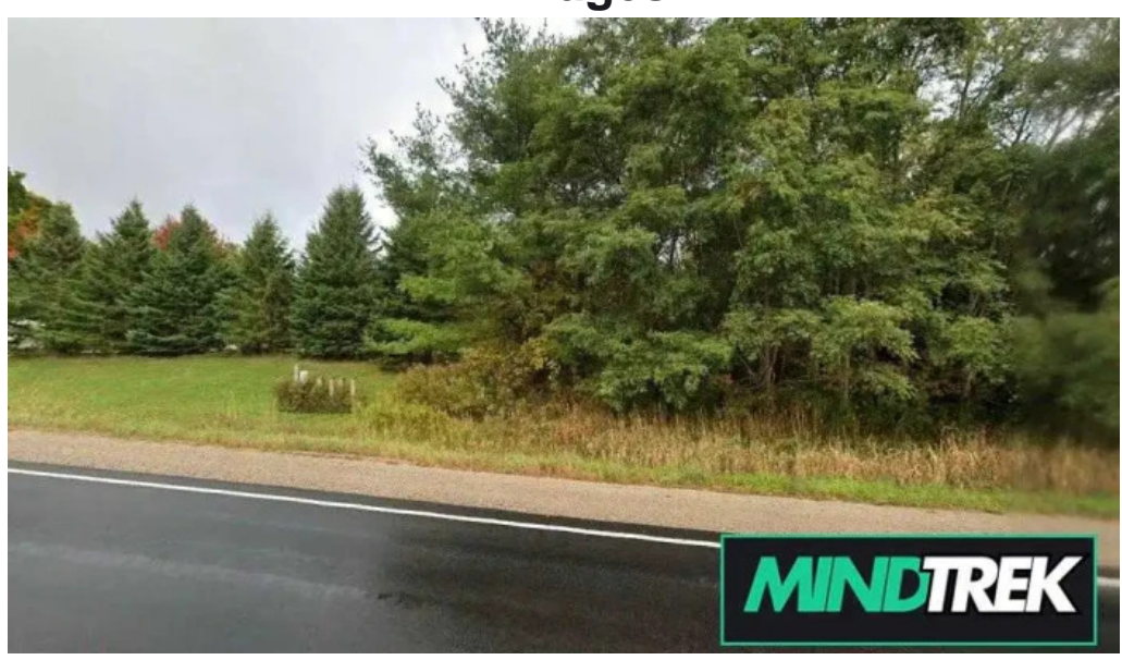
Horseshoe valley counselling oro station