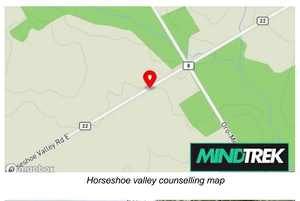
Horseshoe valley counselling map