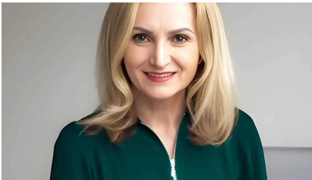
Ascendy therapy by owner