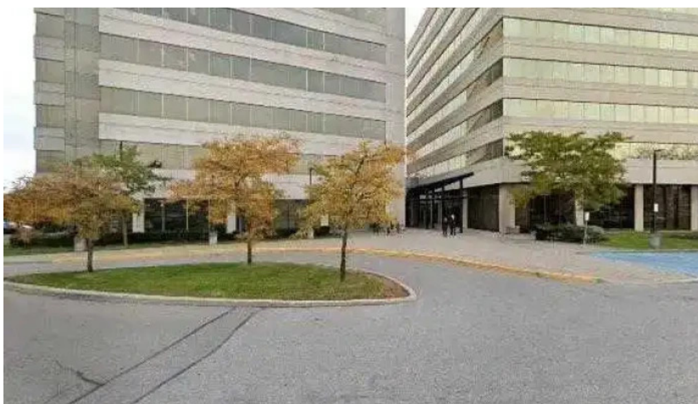
Ascendy therapy all