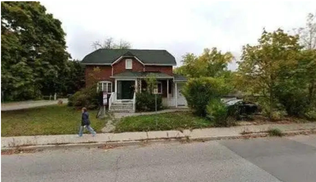
Lukomsky therapy street view 360deg