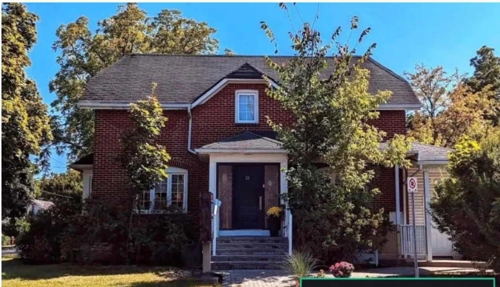
Lukomsky therapy richmond hill