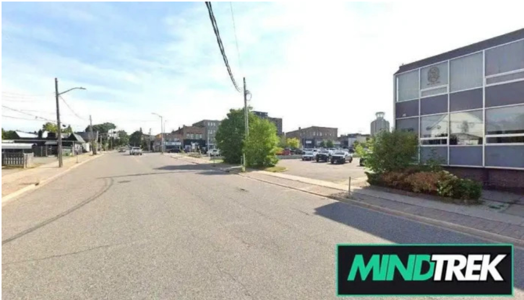
Lighthouse counselling and therapy services sault ste marie

If you need to change any detail that you believe is not correct regarding this page, we urge you to forward a message so that we will adjust it quickly. Thank you in advance thanks for your cooperation.