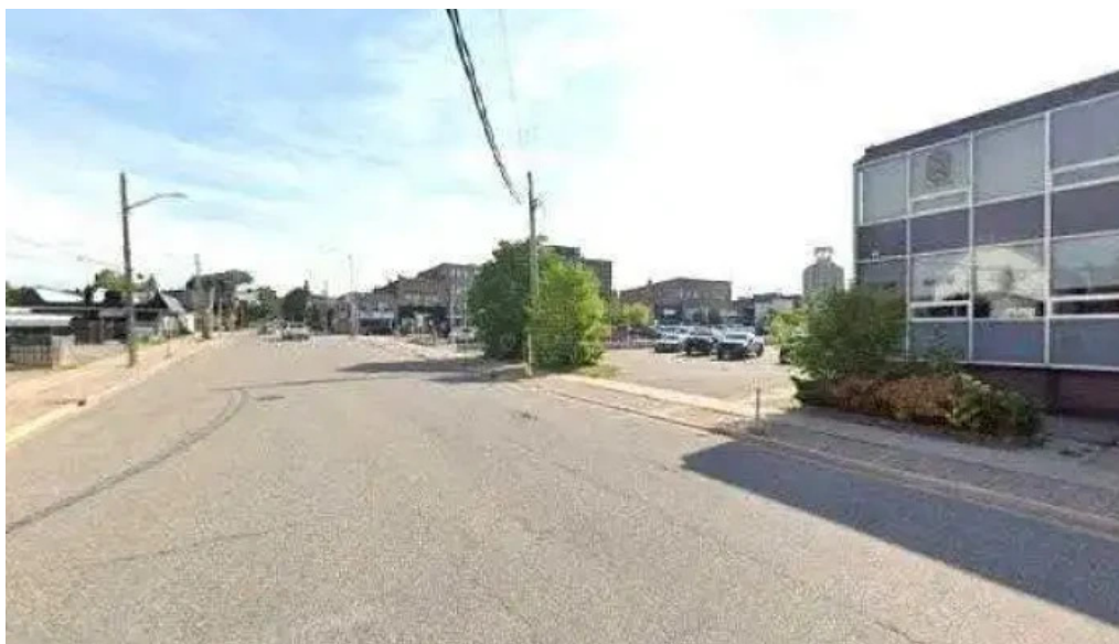
Lighthouse counselling and therapy services all