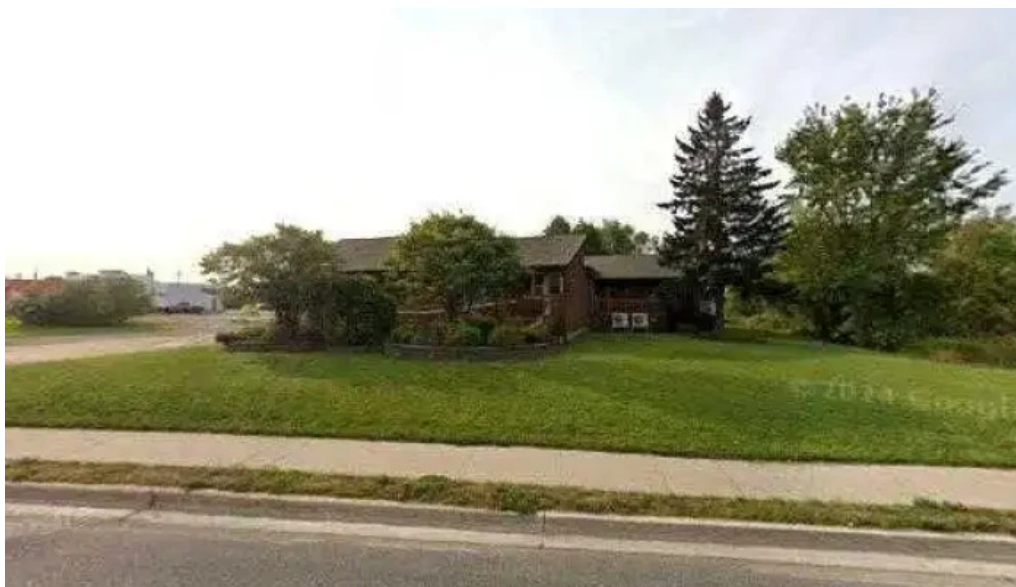
Psychotherapy services tamara thalman m a r p all