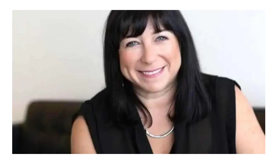
Psychotherapist In Toronto

https://www.mindtrek.ca/psychotherapist/toronto/julie-zikman-therapy-and-consultation-toronto_33971 3.php