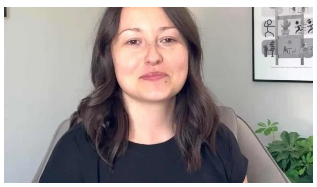
Innersight psychotherapy inc by owner