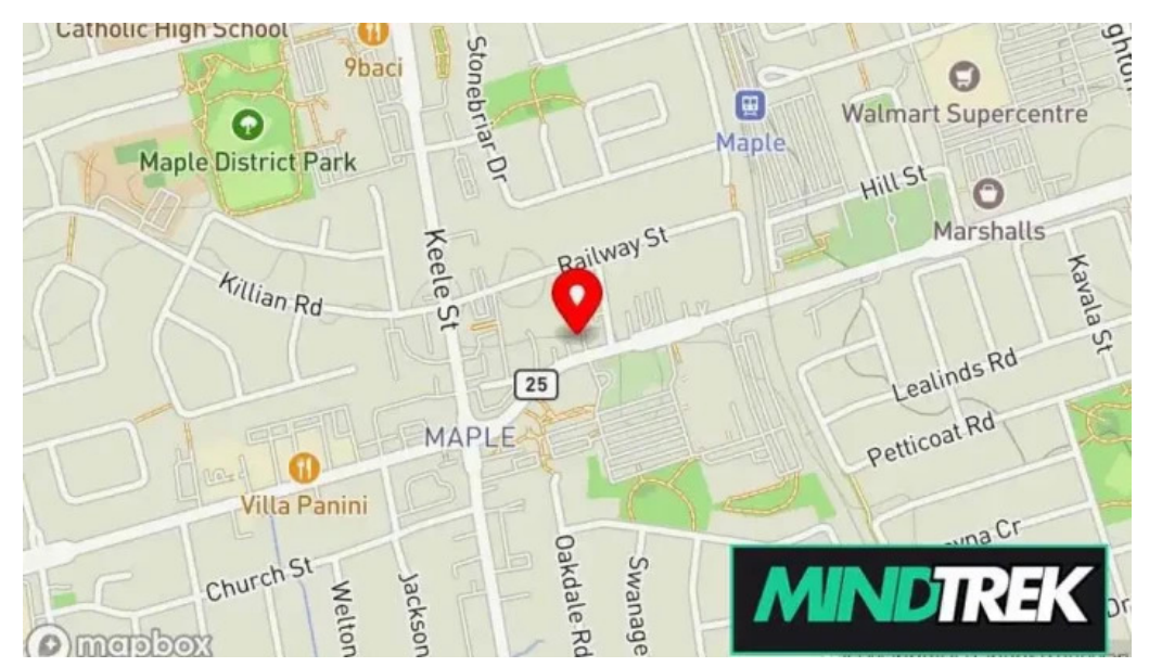
Innersight psychotherapy inc map