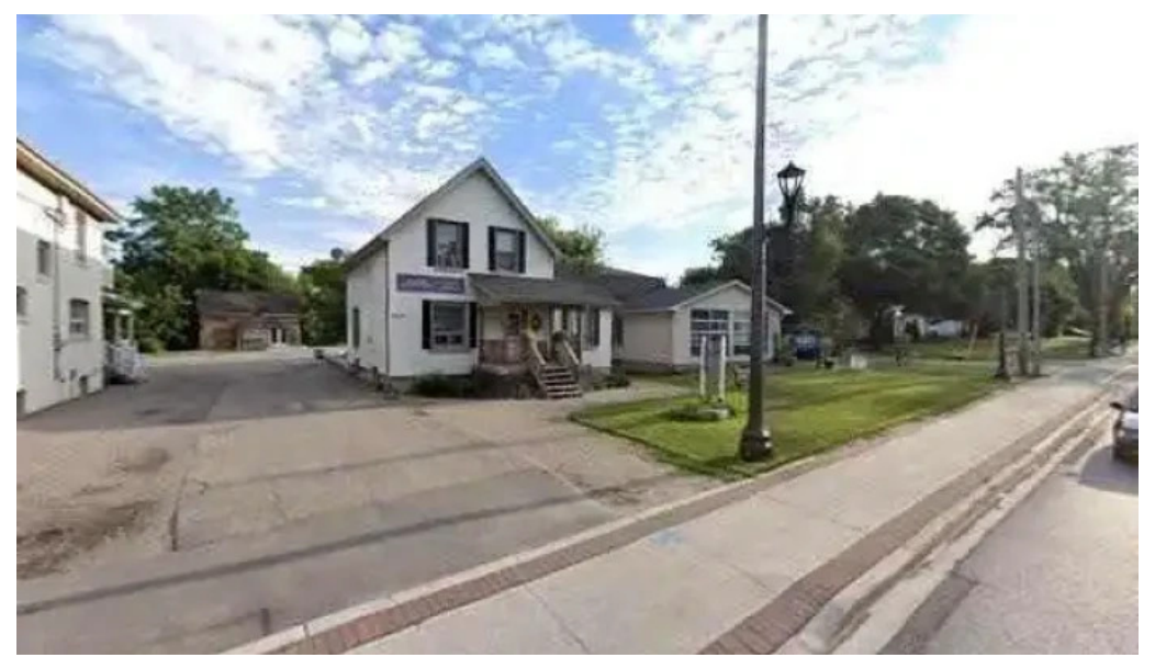
Innersight psychotherapy inc street view 360deg