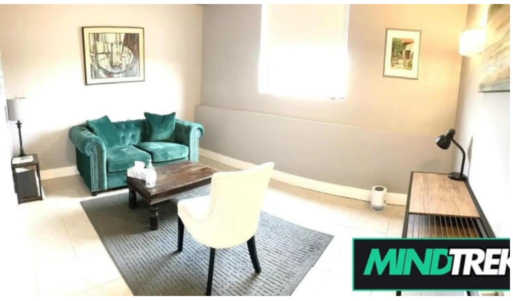
Vaughan counselling and psychotherapy vaughan