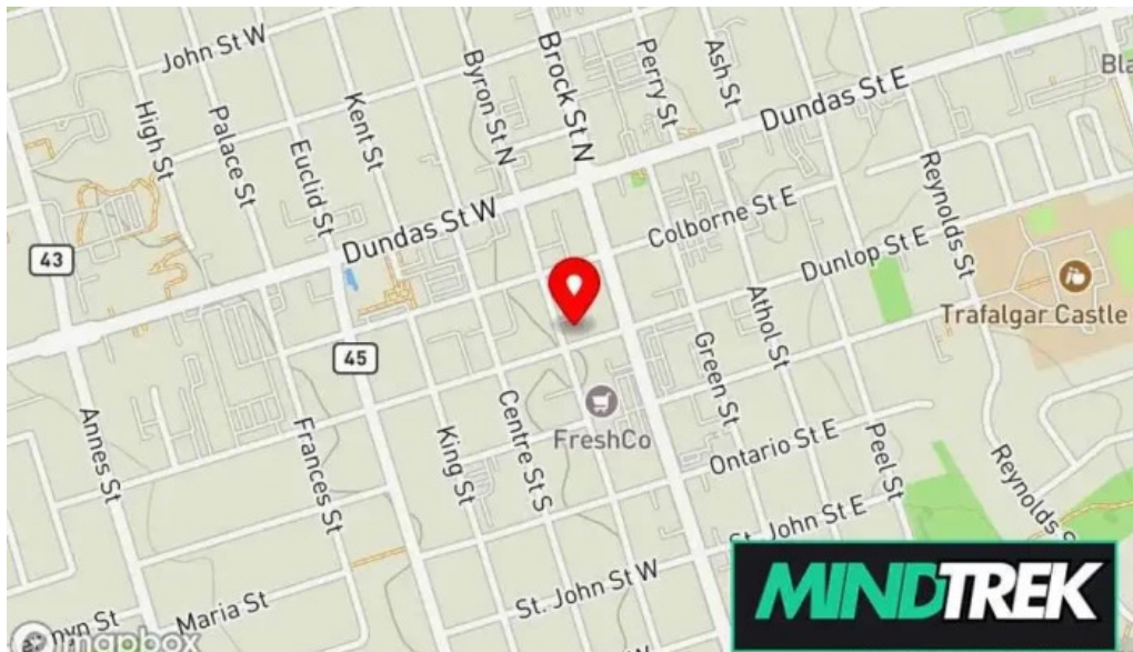
New roots therapy map