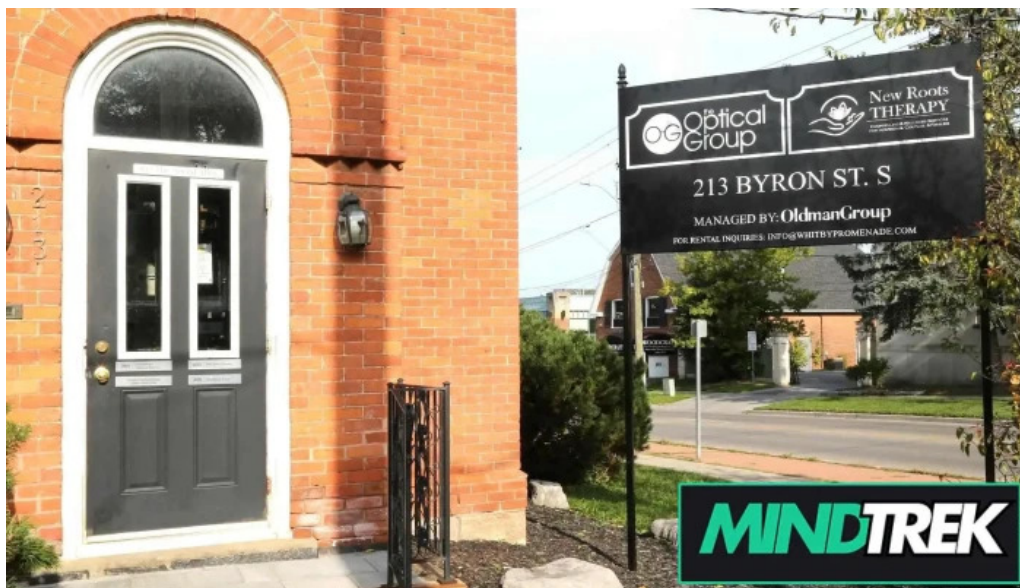
New roots therapy by owner