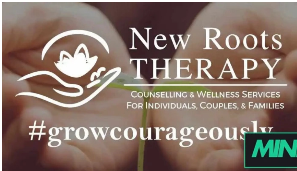
New roots therapy whitby