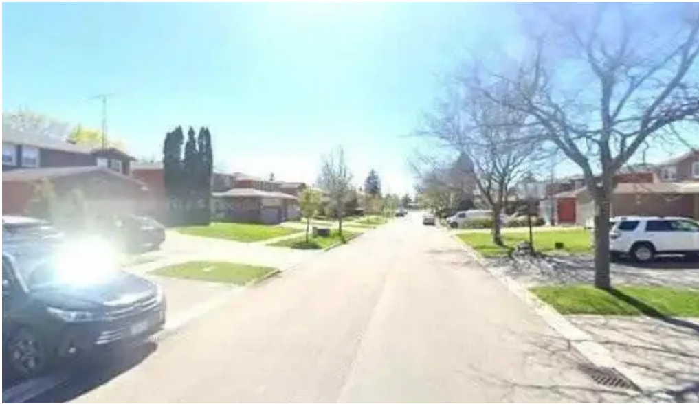
Alderwood therapy all