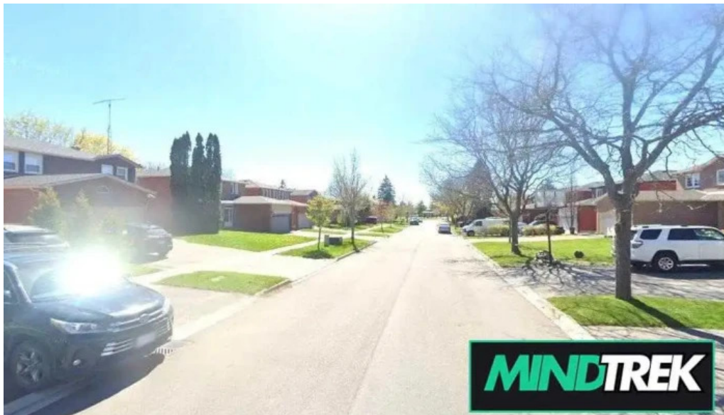
Alderwood therapy whitchurch stouffville