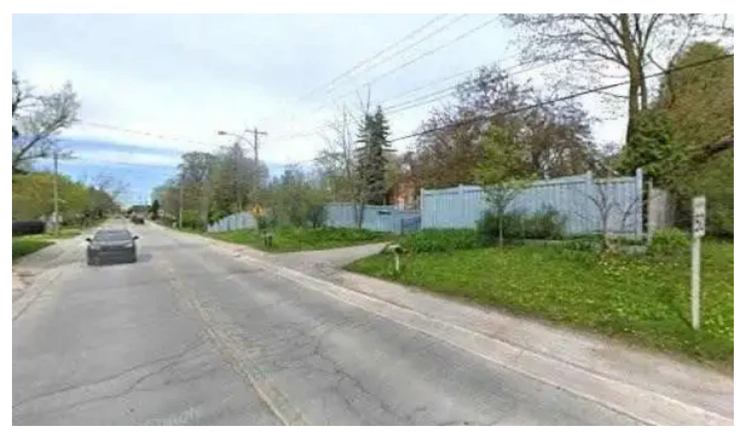
Bloomington counselling consultation services street view 360deg