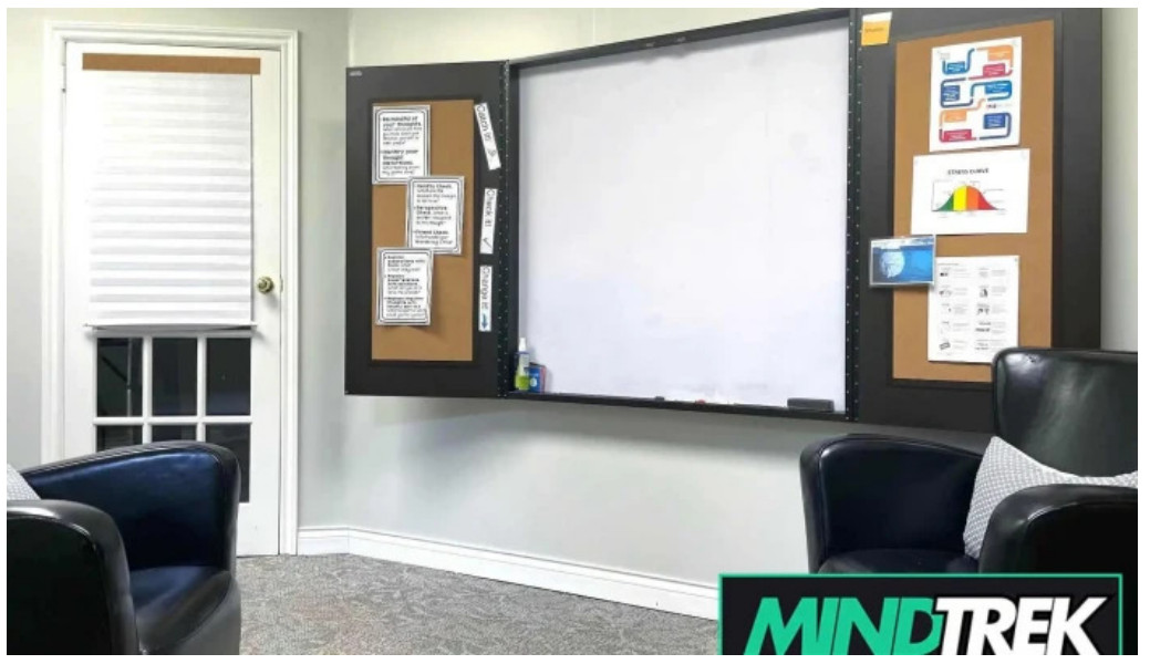
Bloomington counselling consultation services all

Bloomington counselling consultation services by owner