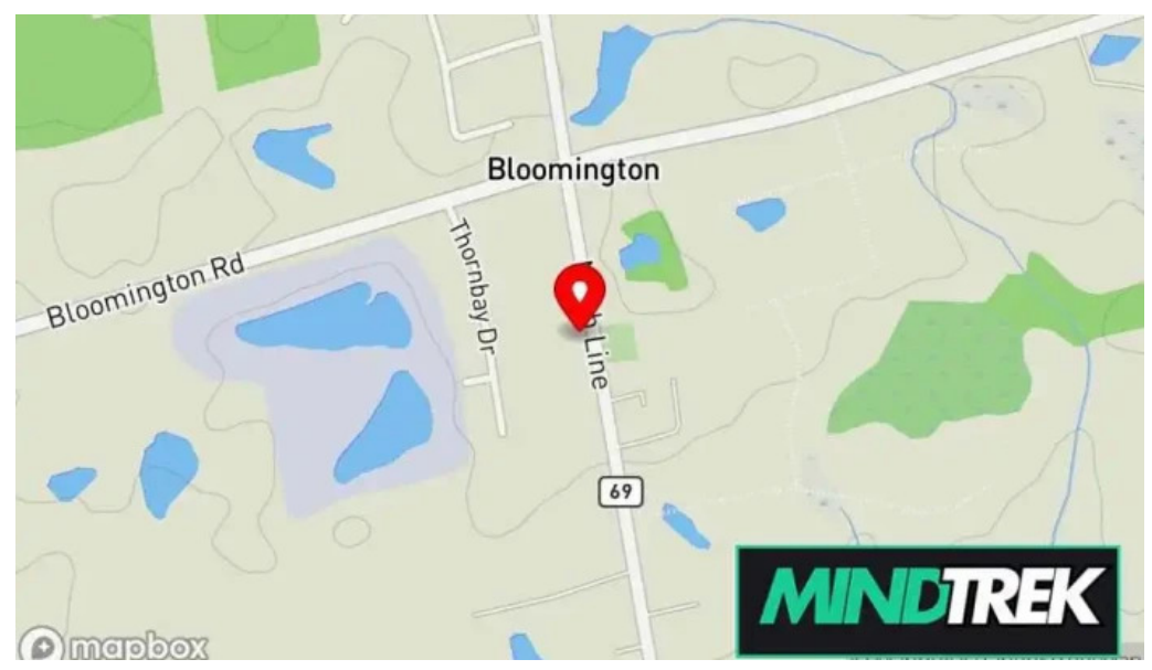
Bloomington counselling consultation services map