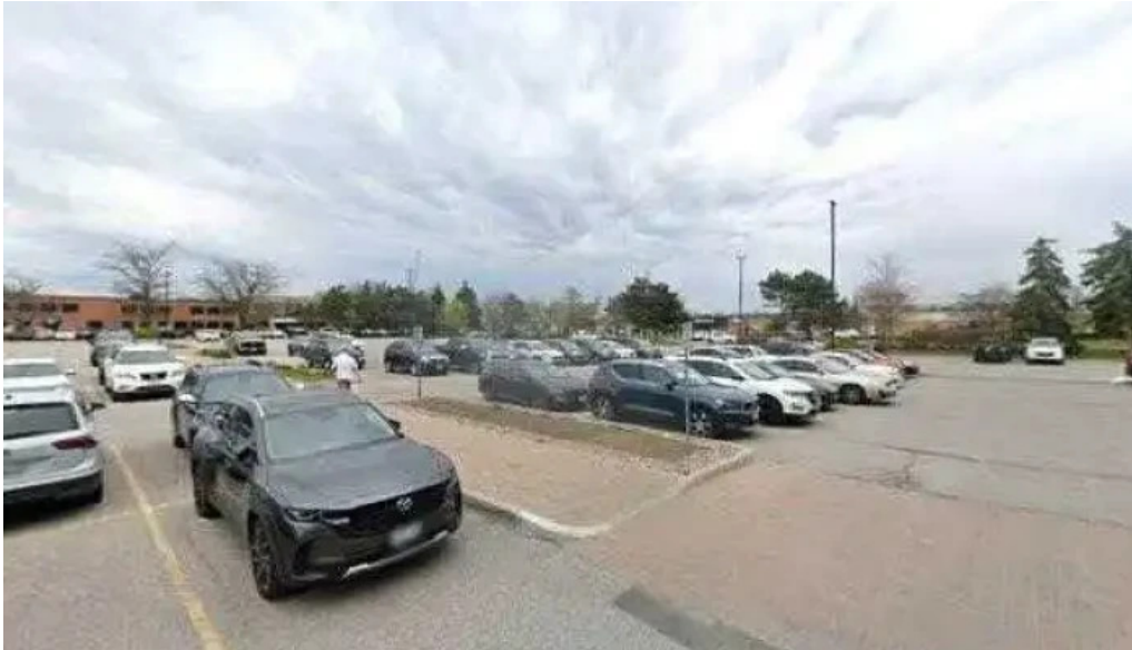
Path positive counselling psychotherapy all