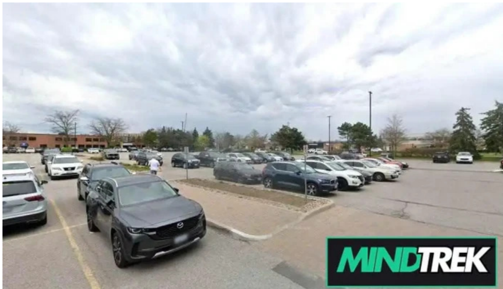
Path positive counselling psychotherapy whitchurch stouffville