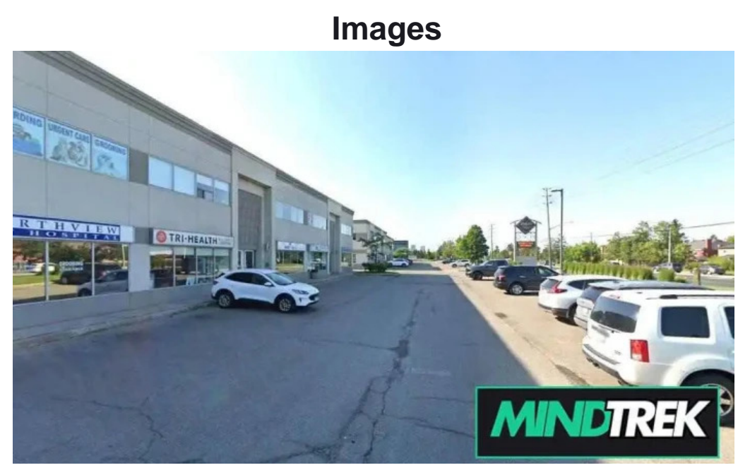
Dalton associates woodbridge

If you wish to alter any detail that you feel is not precise regarding this web, please send us a message so we can we will handle it promptly. In advance we appreciate it.