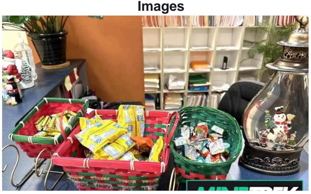
Healthcare management group richmond hill

If you need to change any data that you feel is not accurate about this portal, please deliver a message so that we will handle it at the earliest convenience. Thank you in advance thanks.