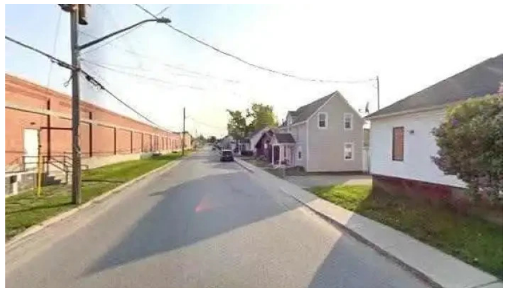
Phoenix centre for children families all