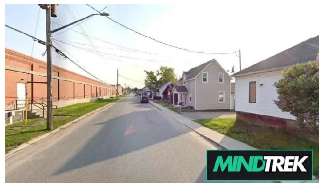
Phoenix centre for children families arnprior