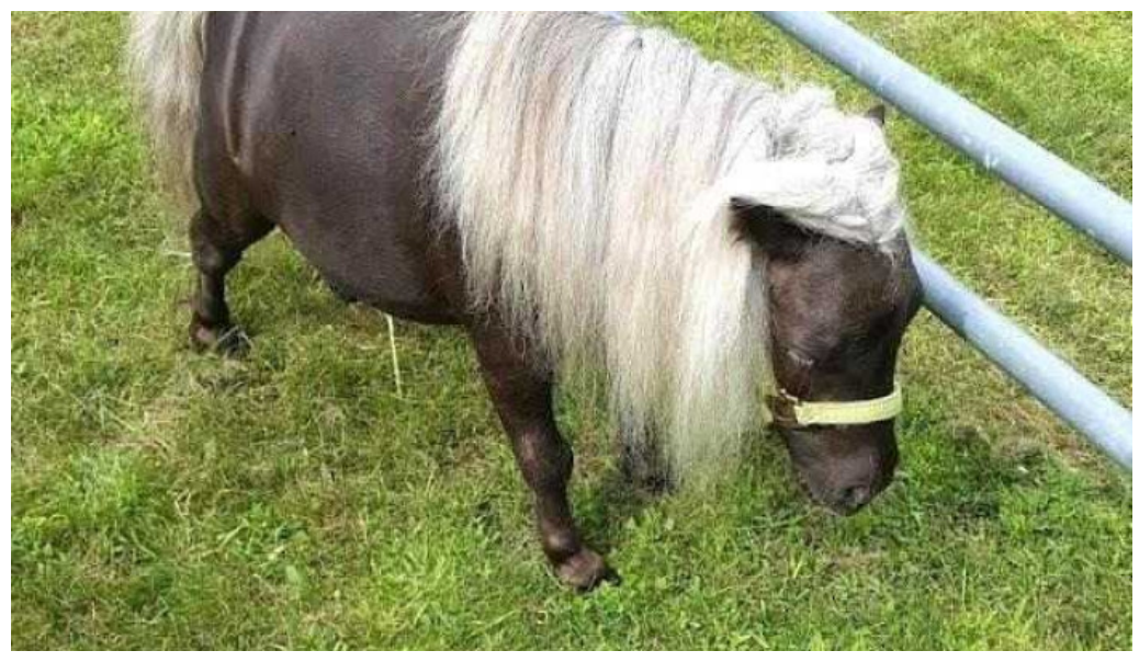
Children s aid society of sdg cornwall