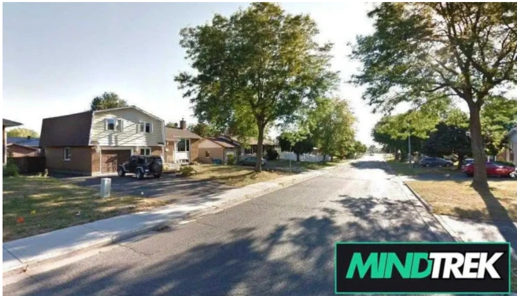
Open hands cornwall