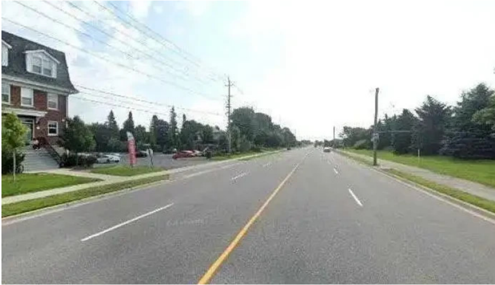
Clear view therapy street view 360deg