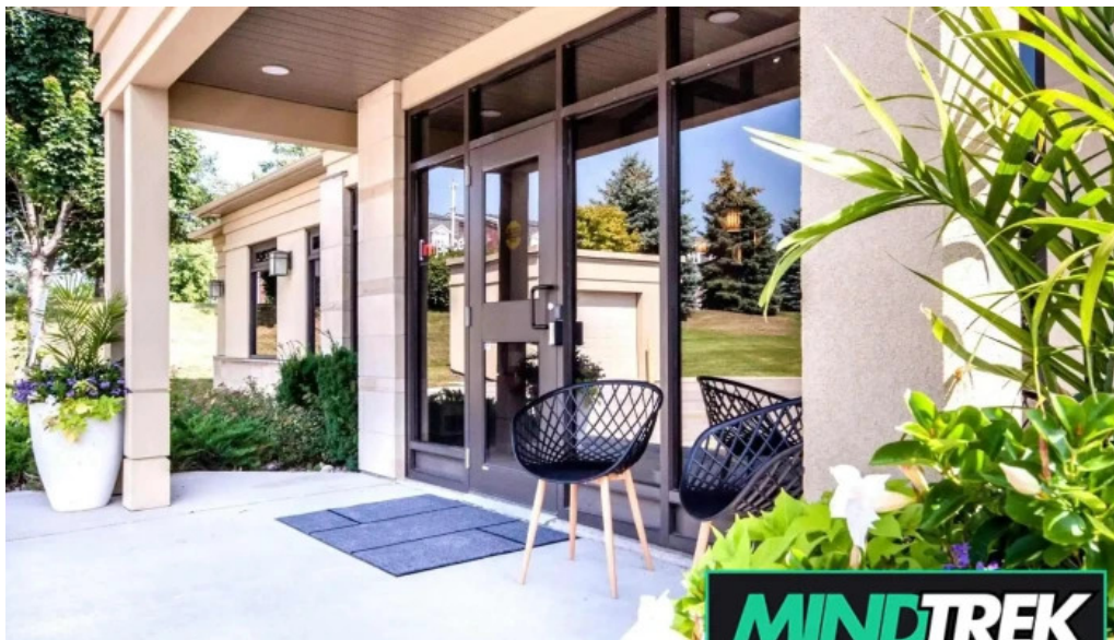
Clear view therapy all