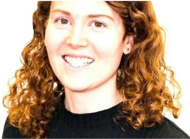
Kaleidoscope counselling collective by owner