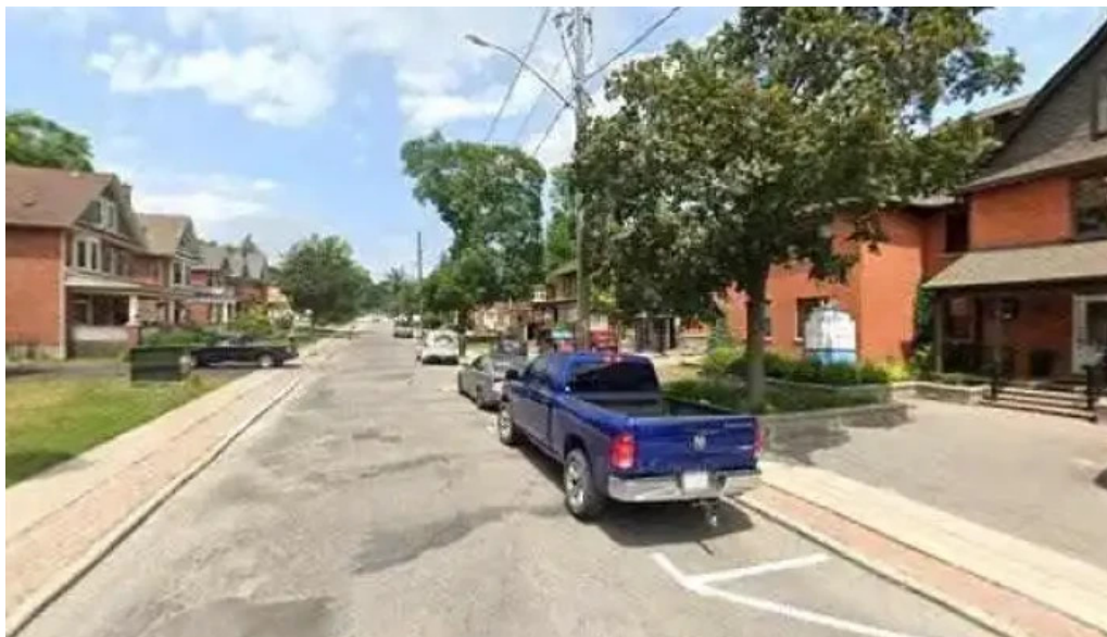
Kaleidoscope counselling collective street view 360deg