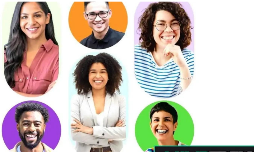
Kaleidoscope counselling collective latest