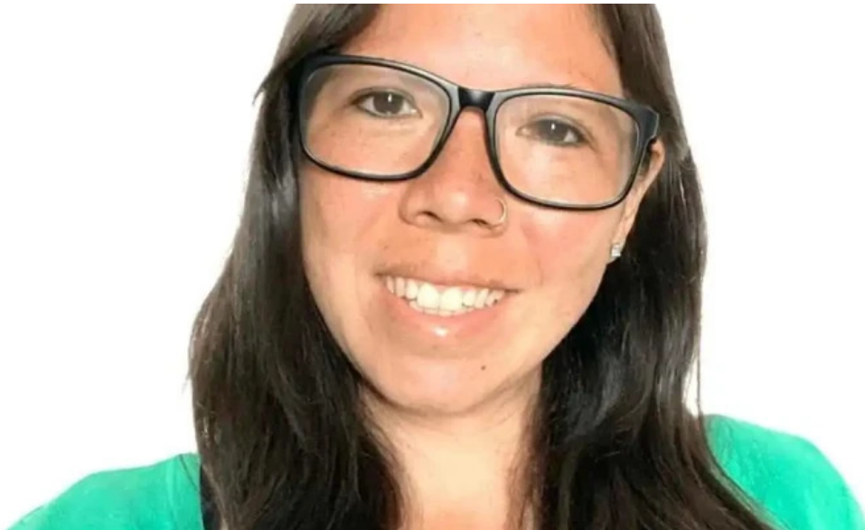
Kaleidoscope counselling collective barrie