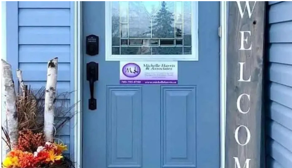
Michelle harris associates barrie