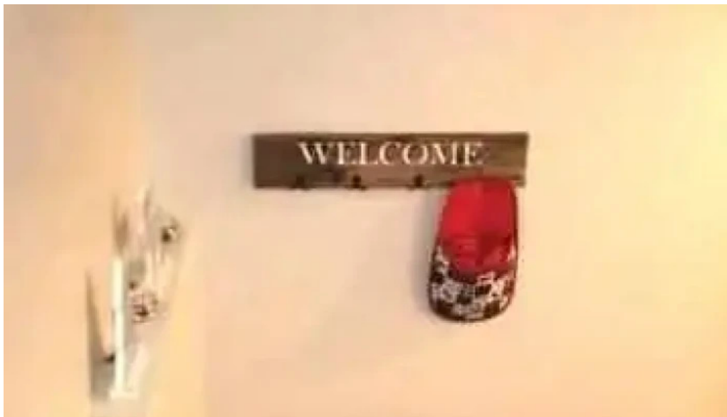
Michelle harris associates by owner