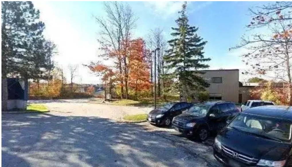
Michelle harris associates street view 360deg