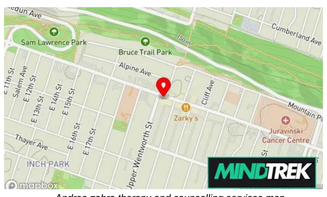
Andrea zahra therapy and counselling services map