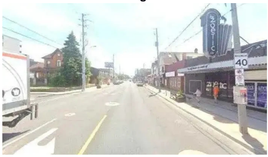
Andrea zahra therapy and counselling services street view 360deg