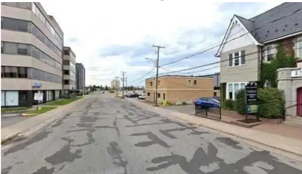
Mending minds counselling julie myers msw rsw street view 360deg