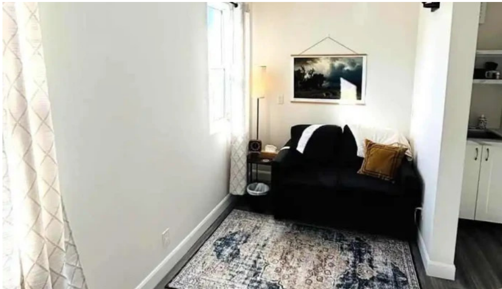
Mending minds counselling julie myers msw rsw all