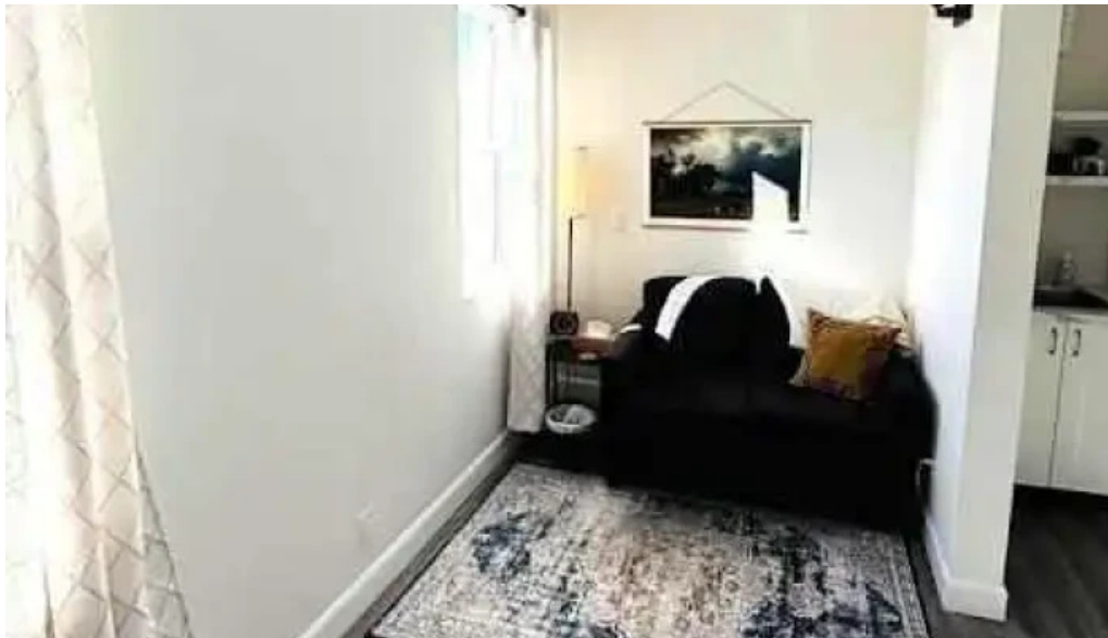
Mending minds counselling julie myers msw rsw sault ste marie