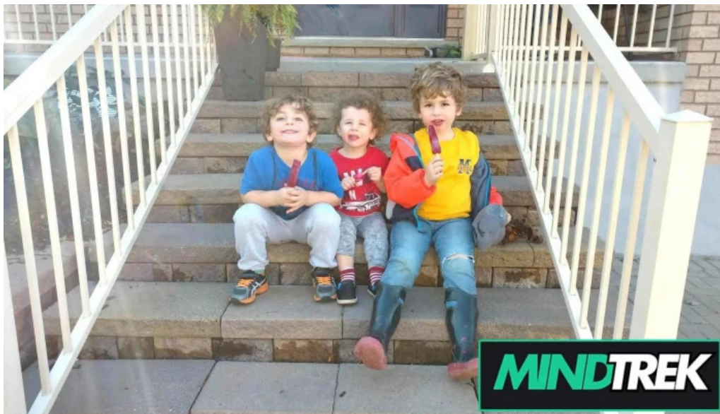
Mariani and associates by owner