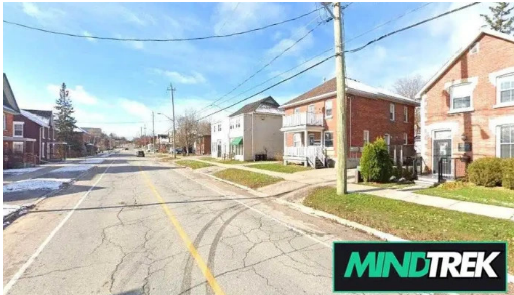
Macpherson communication clinic orillia