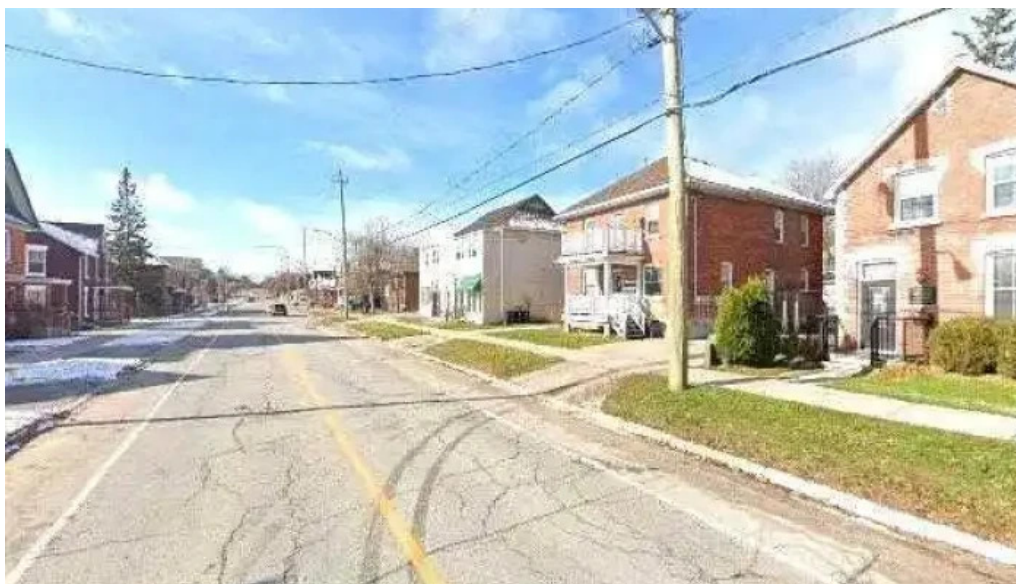
Macpherson communication clinic all