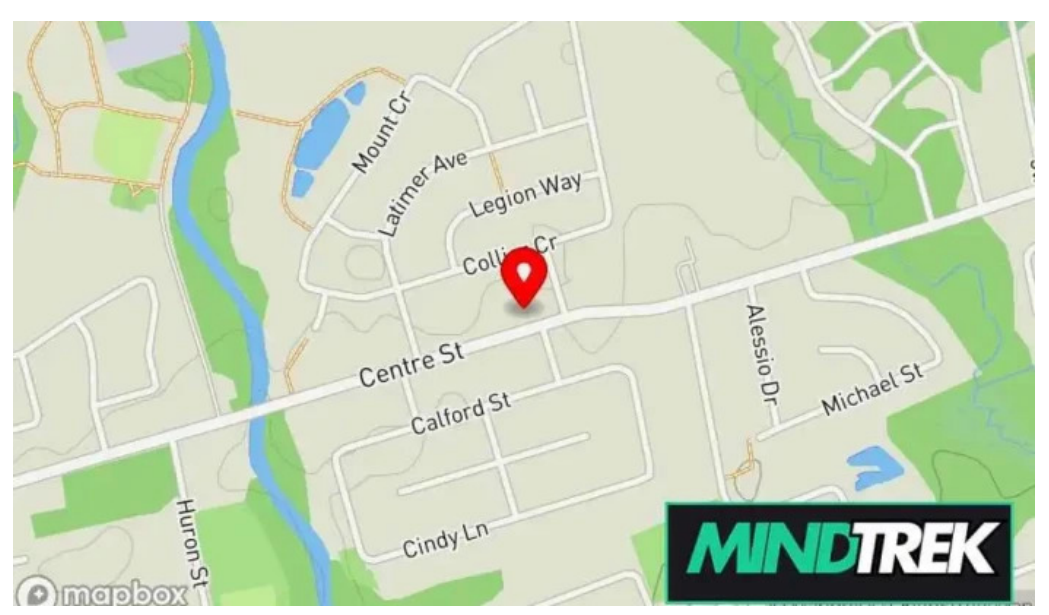
Trumble athletic therapy map