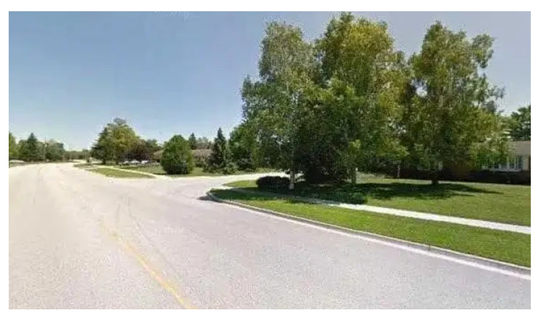
Trumble athletic therapy street view 360deg